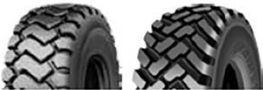
XHA MICHELIN XTLA MICHELIN

17.5 R25 XHA Michelin (transport width<2500 mm) 17.5 R25 XTLA G2 Michelin